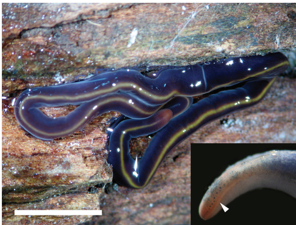
Figure 2. Photograph of live specimen in dorsal view. Scale bar: 1 cm. View in detail of the pale sensorial zone (arrow) below the row of eyes.

spenceri has a greenish blue almost black colour, and the eyes are placed at the anterior and posterior ends of the body, while in the Argentine specimens they can only be seen at the anterior end. Other species that are similar in external morphology to C. coerulea , A. purpurea and A. walhallae , regrouped within the collective